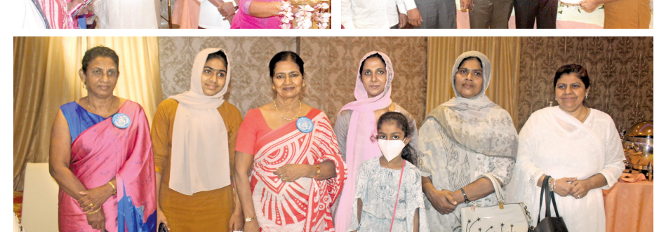
Annual General Meeting - Fiscal Year 2021 / 2022