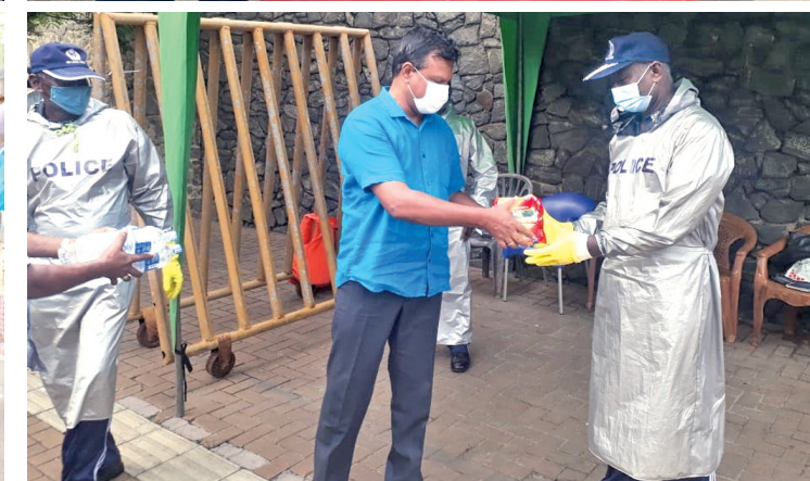
COVID 19 - Project 06 Donations to Hospitals