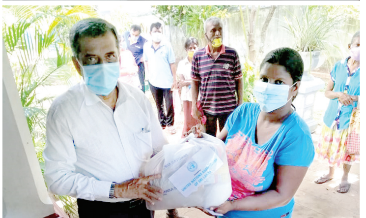
COVID 19 - Project 05 Donations to MOH Offices