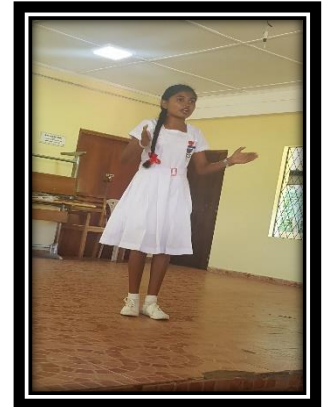
Speech Contest - 2018