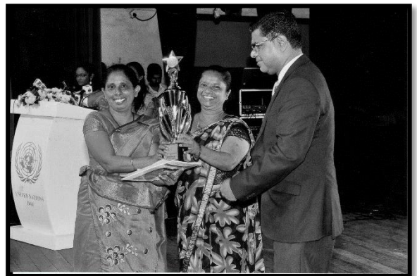
Best Study Circles Contest 2016/2017 G / Richmond College, Galle