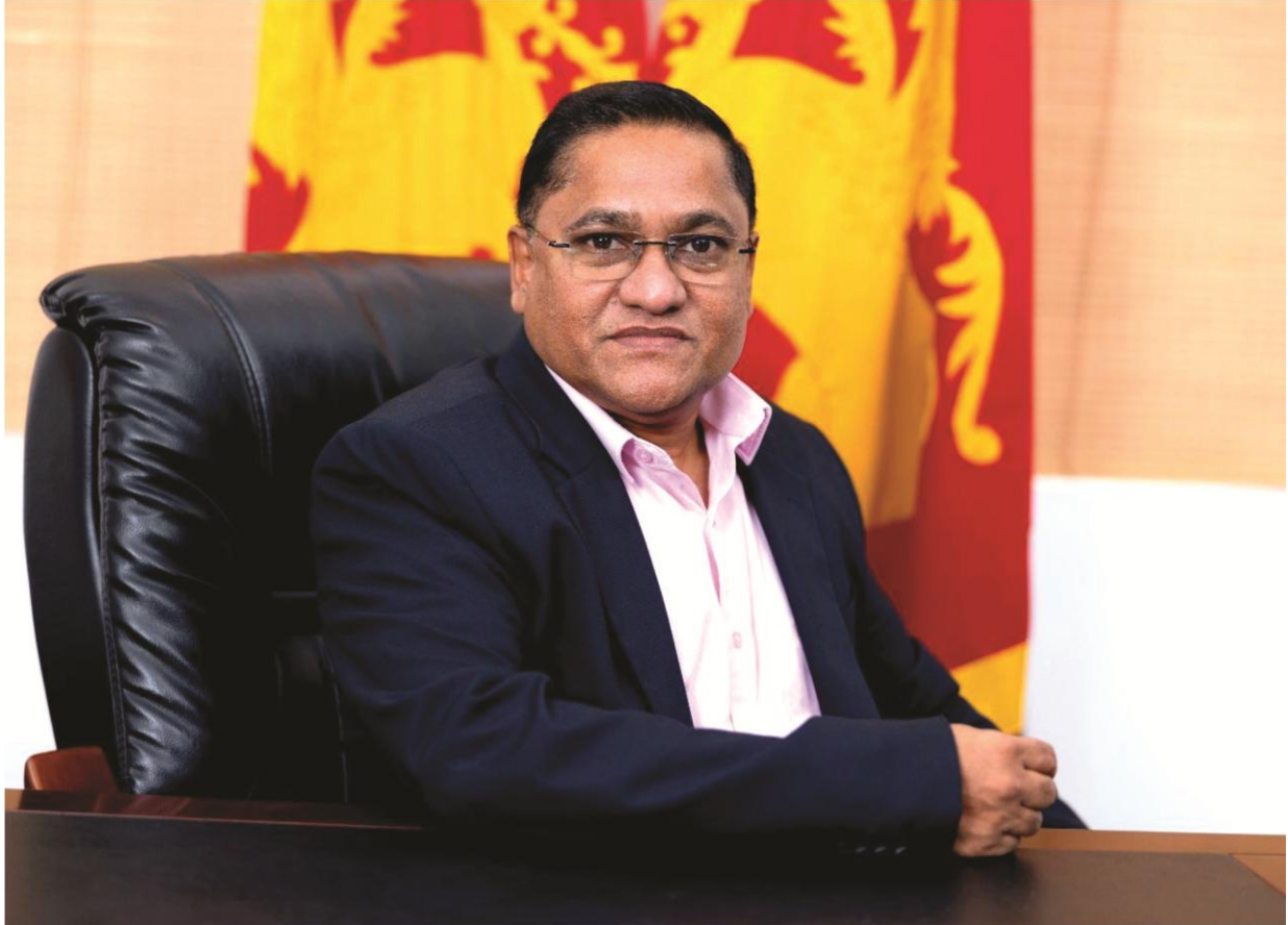
Honorable H. M. Vijitha Herath MP Minister of Foreign Affairs, Foreign Employment and Tourism